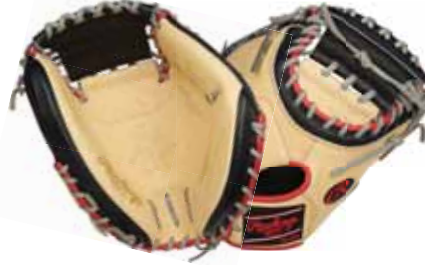
PRORCM33UC 33" CM33U PATTERN