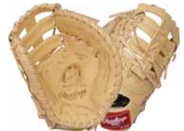
PROSDCTCC PROSDCTCC-RH 13" DCT PATTERN • Single Post, Double Bar Web