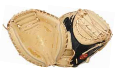
PROCM41CCF 34" CM41 PATTERN • 1-Piece Solid Web