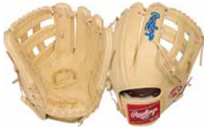
PROSKB17C 12¾" KB17 PATTERN • Pro H™ Web