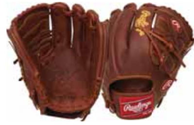
PRO205-9TI PRO205-9TI-RH 11¾" 200FS PATTERN • Two-Piece Solid Web • Finger Shift Pattern