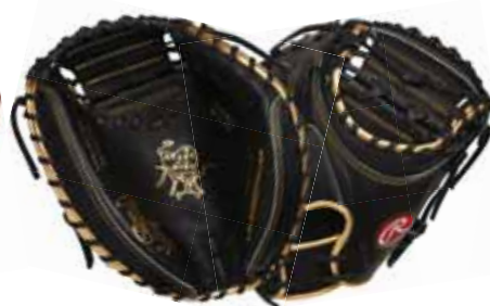
PROGS24 33½" GS24 PATTERN • One-Piece Solid Web