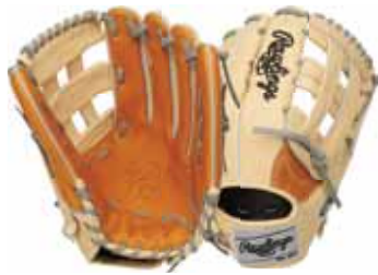
PRO3039-6TC PRO3039-6TC-RH 12¾" 303FS PATTERN • Pro H™ Web • Finger Shift Pattern