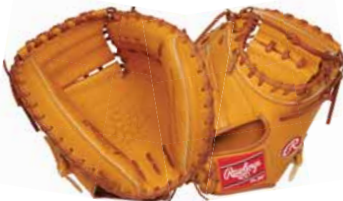
PROCM33T 33" CM33 PATTERN • One-Piece Solid Web