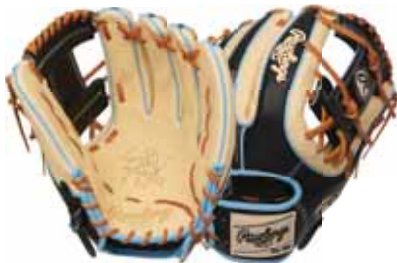
PRO315-2CBC 11¾" 31 PATTERN • Pro I™ Web