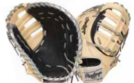
PRORFM18-10BC PRORFM18-10BC-RH 12½" FM18 PATTERN • Single Post Double Bar Web