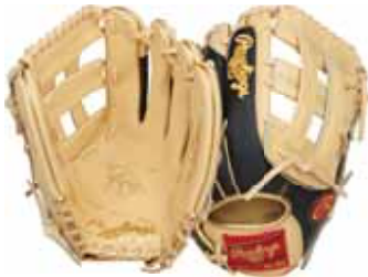
PROR3028U-6C PROR3028U-6C-RH 12½" 302U PATTERN