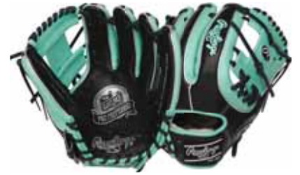
PROS315-2BOM 11¾" 31 PATTERN • Pro I™ Web