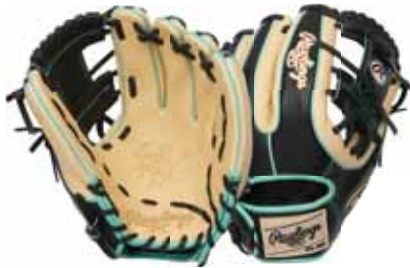
PROR314-2CBM 11½" 31 PATTERN • Pro I™ Web • Narrow Fit