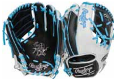
PROR204-8BWSS 11½" 200 PATTERN • One-Piece Solid Web • Narrow Fit