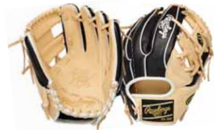
PROR934-2CB 11½" 93 PATTERN • Pro I™ Web • Narrow Fit