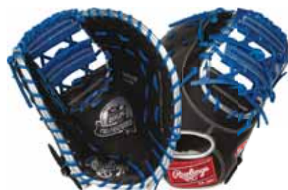
PROSAR44B PROSAR44B-RH 12¾" AR44 PATTERN • Horizontal Web with X-Lacing