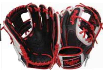
PRO204-2BSCF 11½" 200 PATTERN • Pro I™ Web