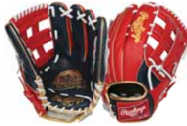
PROSRA13 PROSRA13-RH 12¾" RA13 PATTERN • Pro H™ Web