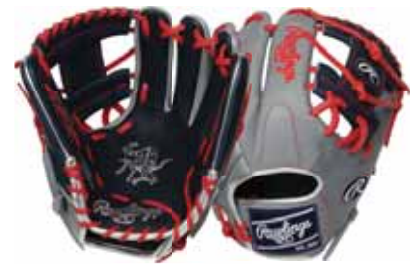
PRORFL12N 11¾" FL12 PATTERN • Pro I™ Web • Narrow Fit