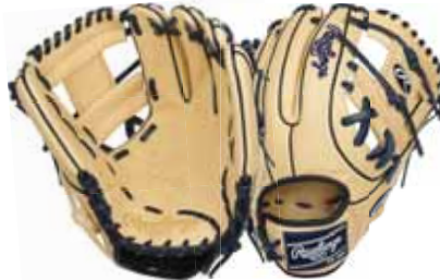
PROR234U-2C PROR234U-2C-RH 11½" 243U PATTERN