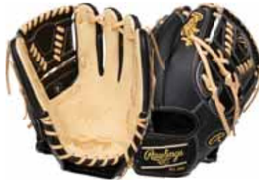
PRO206-30CBSS PRO206-30CBSS-RH 12" 200 PATTERN • Laced 2 Piece Solid Web