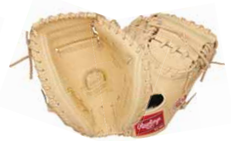
PROSCM43C 34" CM43 PATTERN • One-Piece Solid Web