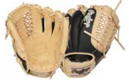
PROS205-4CSS PROS205-4CSS-RH 11¾" 200 PATTERN • Modified Trap-Eze® Web