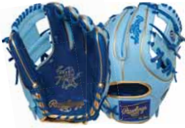
PROR312U-2R 11¼" 312U PATTERN