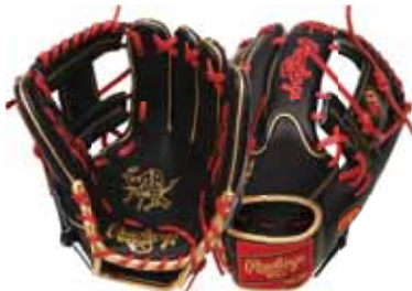
PRO205W-2BG 11¾" 200 WINGTIP PATTERN • Pro I™ Web