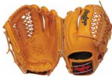
PROR205-4T PROR205-4T-RH 11¾" 200 PATTERN • Modified Trap-Eze® Web • Narrow Fit