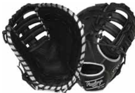
ECFBM-10B-3/0 ECFBM-10B-0/3 12"