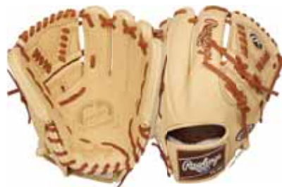
PROS205-30C PROS205-30C-RH 11¾" 200 PATTERN • Laced Two-Piece Solid Web