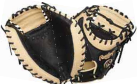
PROYM4BC 34" YM4 PATTERN • One-Piece Solid Web