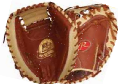
PROSCM33BRC 33" CM33 PATTERN • One-Piece Solid Web