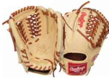
PRO205-4CT PRO205-4CT-RH 11¾" 200 PATTERN • Modified Trap-Eze® Web