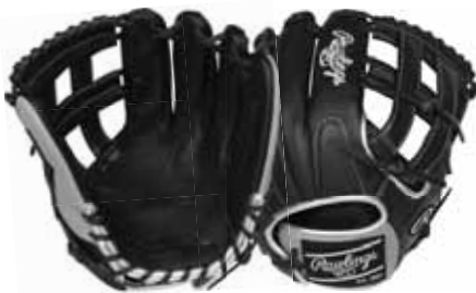
EC1225-6B-3/0 EC1225-6B-0/3 12¼"