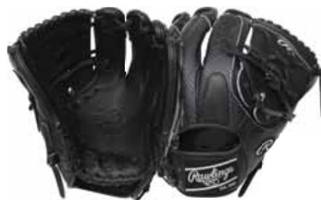
PRO205-9BCF PRO205-9BCF-RH 11¾" 200 PATTERN • Two-Piece Solid Web