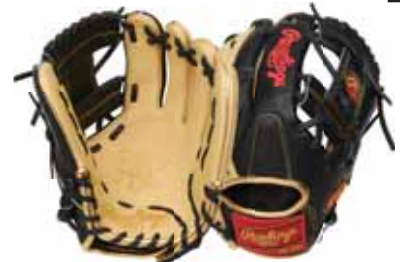
PROR204U-2CB 11½" 200U PATTERN