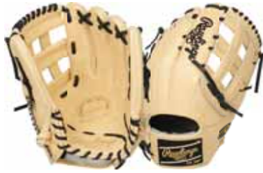
PROS3039-6CSS PROS3039-6CSS-RH 12¾" 303 PATTERN • Pro H™ Web