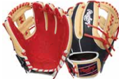
PRO314-19SN 11½" 31 PATTERN • X-Laced Single Post Web