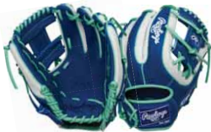
PROR314-2RW 11½" 31 PATTERN • Pro I™ Web • Narrow Fit