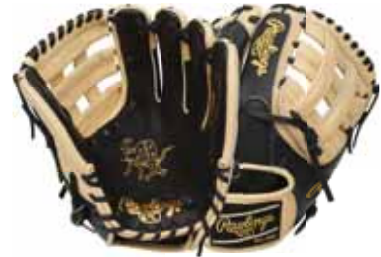
PRO205-6BCSS 11¾" 200 PATTERN • Pro H™ Web