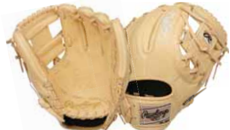
PRO312-2C 11¾" 31 PATTERN • Pro I™ Web