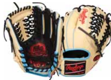
PROS204-4BSS PROS204-4BSS-RH 11½" 200 PATTERN • Modified Trap-Eze® Web