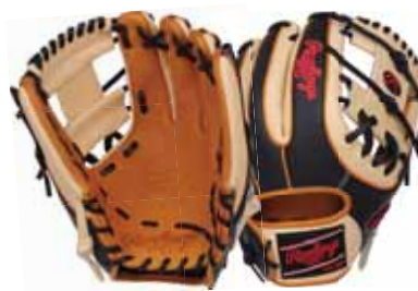
PROR314-2TCSS 11½" 31 PATTERN • Pro I™ Web • Narrow Fit