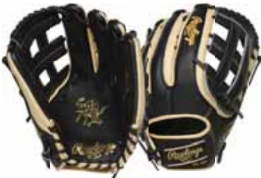
PROR3319-6BC PROR3319-6BC-RH 12¾" 331 PATTERN • Pro H™ Web • Narrow Fit