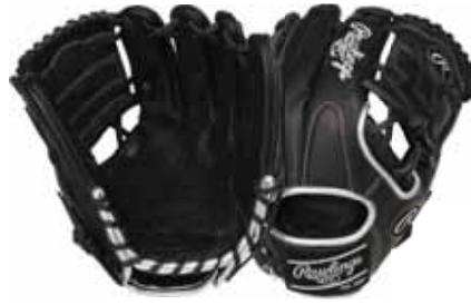
EC1175-8B-3/0 EC1175-8B-0/3 11¾"