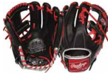
PROSFL12B 11¾" FL12 PATTERN • Pro I™ Web