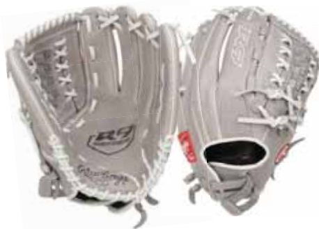
R9SB125-18G-3/0 R9SB125-18G-0/3 12½" • Double-Laced Basket Web®