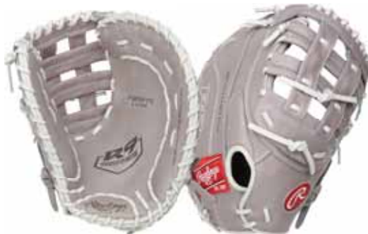
R9SBFBM-17G-3/0 R9SBFBM-17G-0/3 12½" • Modified Pro H™ Web