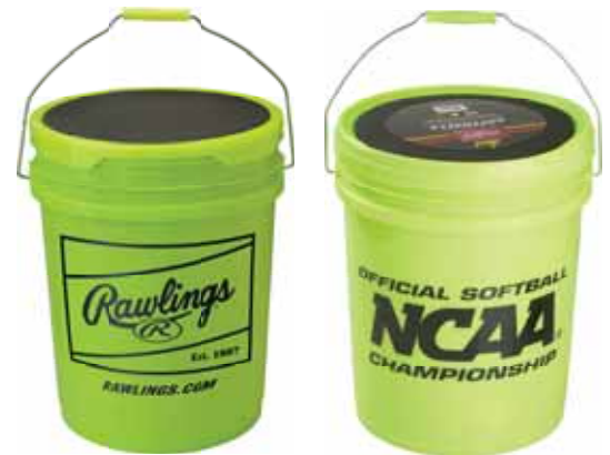
RSBBUCK6G6PKS0 • 6-gallon optic yellow bucket with lid • Foam seat for comfort • (6) buckets per pack • Rawlings logo on side 1 in black print • Custom logo on side 2 in black print • Black single color printing only on all sides