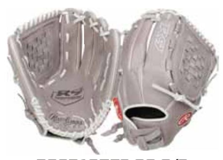
R9SB125FS-3G-3/0 12½" • Basket Web® • Finger Shift