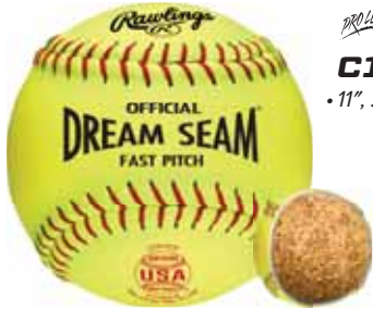
C11RYLA • 11", .47 COR/375 lbs