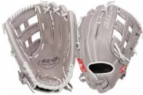
R9SB130-6G-3/0 13" • Pro H™ Web