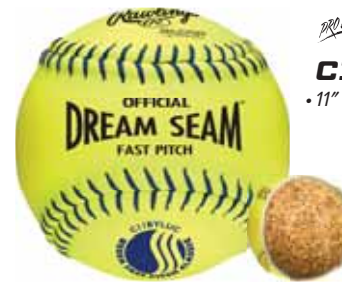
C11BYLUC • 11"