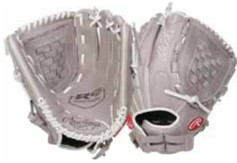
R9SB120-3G-3/0 12" • Basket Web®