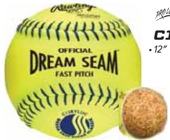
C12BYLUC • 12"