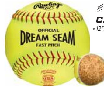
C12RYLAH • 12", .47 COR/375 lbs