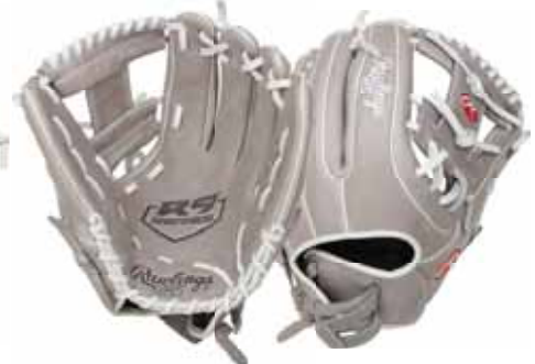
R9SB715-2G-3/0 11¾" • Pro I™ Web