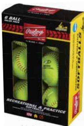
• 6-ball packs • Assorted league stamps