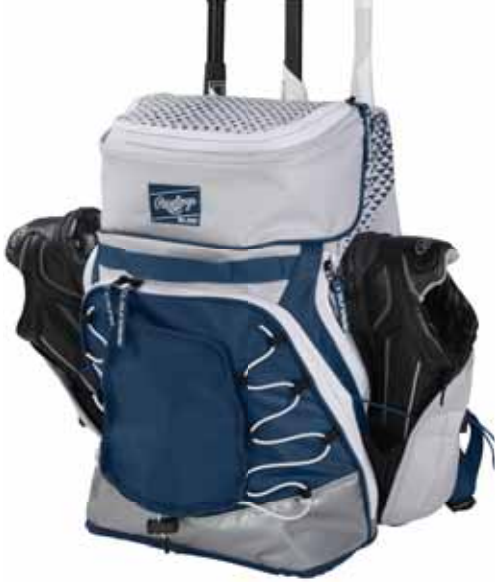
R800 SOFTBALL BACKPACK • 19" H x 13" W x 11" D • 40 liters