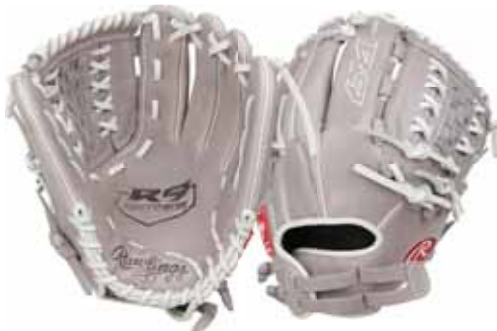
R9SB120FS-18G-3/0 12" • Double-Laced Basket Web® • Finger Shift