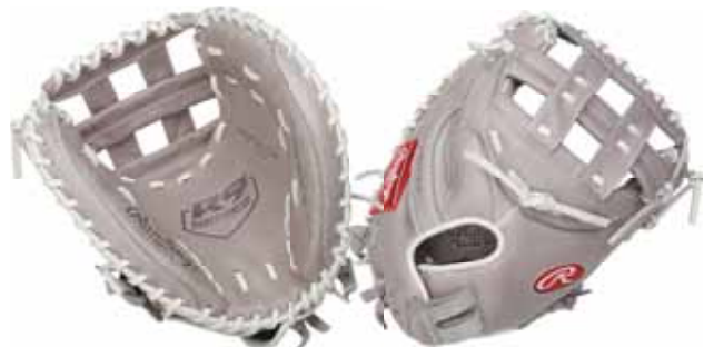
R9SBM33-24G-3/0 33" • Modified Pro H™ Web